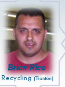
Brian Rice Recycling (Trenton)