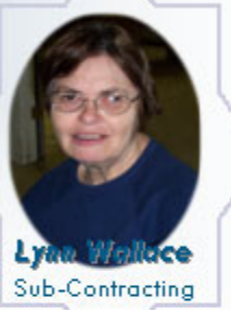
Lynn Wallace Sub-Contracting