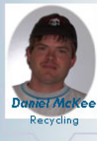
Daniel McKee Recycling

Appreciation is extended to each of these dedicated employees for their PERFECT ATTENDANCE during the 4th quarter of 2009.