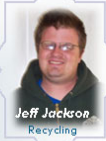
Jeff Jackson Recycling