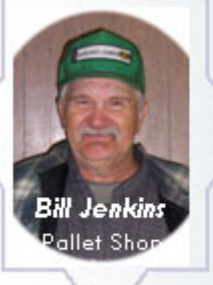
Bill Jenkins Pallet Shop