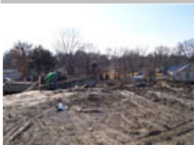
BEFORE: Dock area

The recycling processing plant dock area previously was a gravel lot with only three bays for semi-trucks. Under those conditions, the processing plant experienced a major bottleneck loading and unloading recycling materials at the dock.