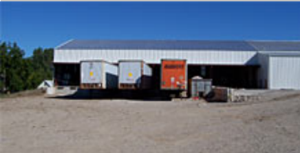
AFTER: Dock area

Now with the dock extended to accommodate six semi-trucks, production has become more efficient. For the employees safety, enclosing the dock area was included in the project. The enclosure of the dock area provides a shelter to that area in all inclement weather including keeping the concrete clear of ice during the winter months .