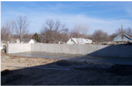
Another view of the start of the new dock area