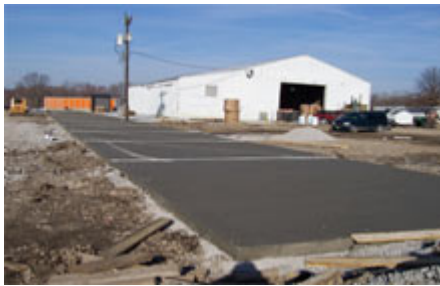
Driveway on south side of Recycling Building