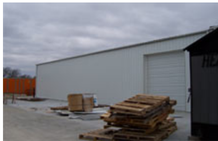
Exterior of the completed new extension on the south side