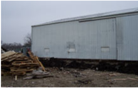
South side of Recycling Building before the construction