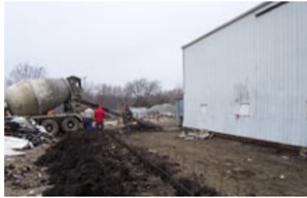
Footings being poured for the new extension