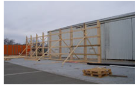
New extension wall going up