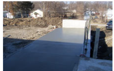
Start of the new dock area