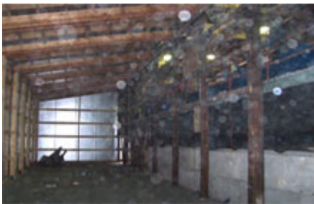
Interior of the completed new extension